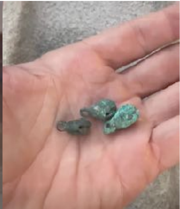
Small pitcher, Museum of Northern Arizona Copper bells, Arizona Origins Facebook page