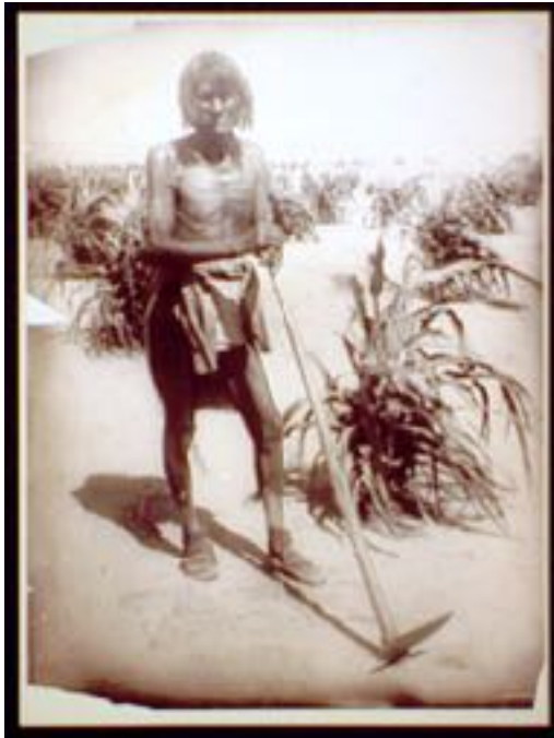
Colored and enlarged historic photo