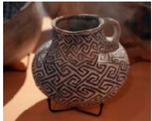
Rocks below Wukoki Pueblo combined with pot at the Museum of Northern Arizona