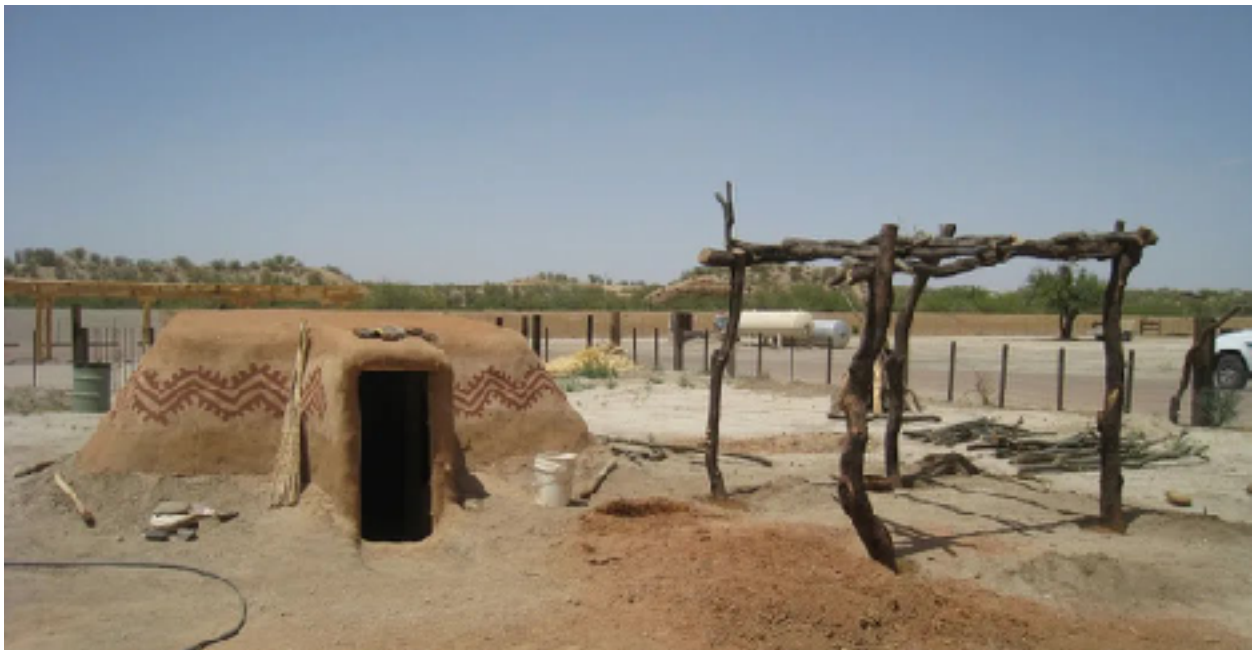
Based on pit house replica at Steam Pump Ranch, Oro Valley, Arizona combined with local Flagstaff area natural environment