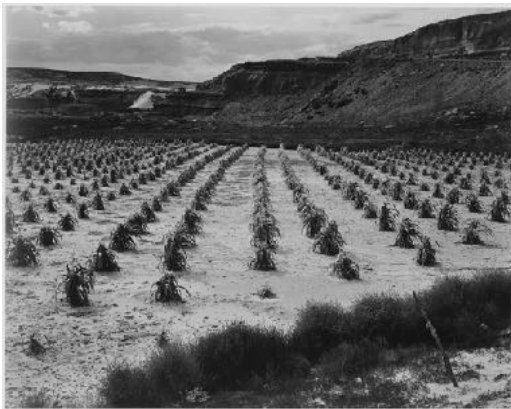
Recolored historic photo of Native American corn field near Tuba City, Arizona