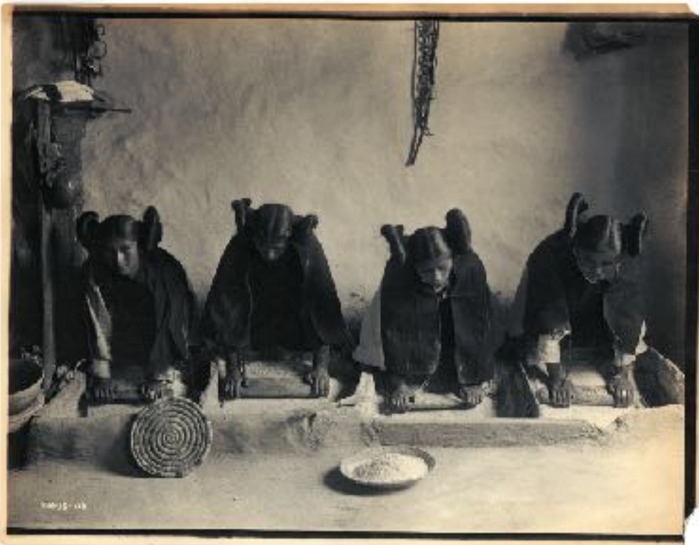
Animated historic photo, AI decided to add another girl, go figure