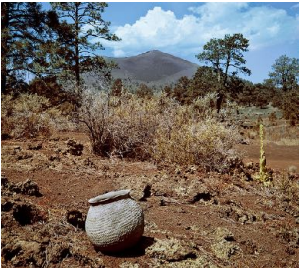
Expanded and added smoke to this photo from Arizona Highways February 1974