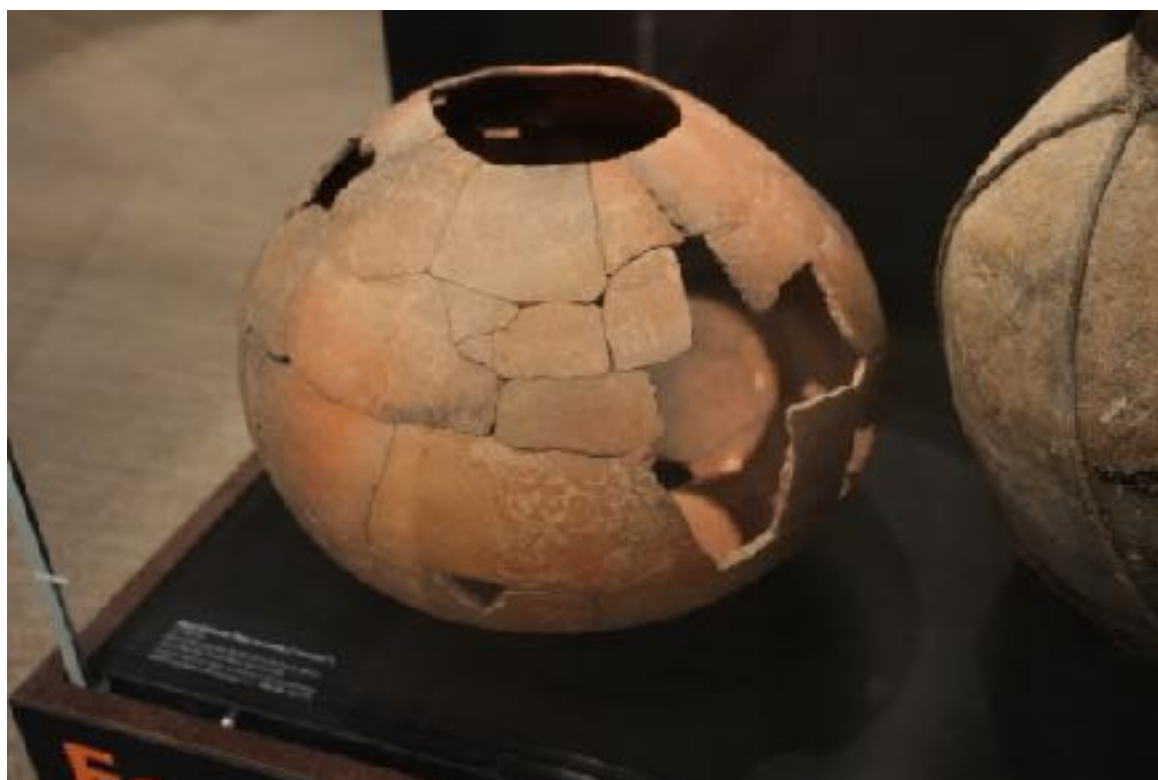
Arizona State Museum, the AI didn't get the shape or texture just right but it was still in the spectrum of real pots so I just left it.