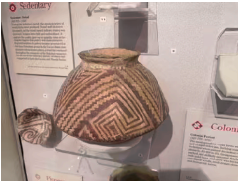
Casa Grande National Monument