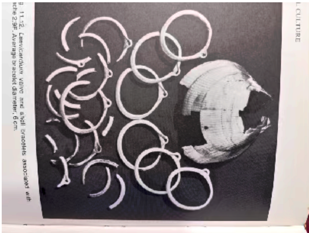
The Hohokam Desert Farmers & Craftsmen, Emil Haury, 1976, page 182