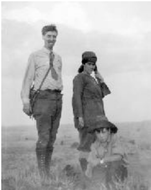
Enlarged and expanded this small old photo