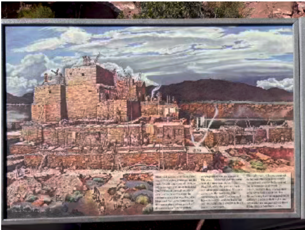
Wupatki National Monument interpretive signage